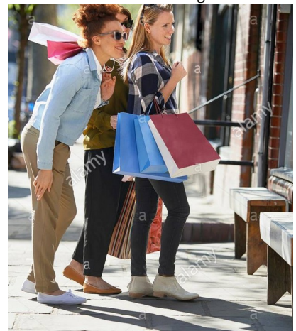
free up parking spaces for more valuable activities

make shopping a means of friendly interaction with neighbors