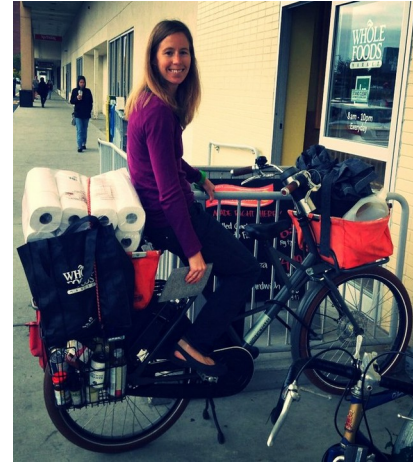
increase community satisfaction, health and sense of well being

spend more money in local shops over time than drivers do