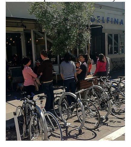
create a pleasant atmosphere that encourages more people to come

take up less space so more people can come to spend even more money