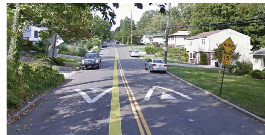
Speed Hump - North Avenue, Dobbs Ferry 11/16 N.T.S.