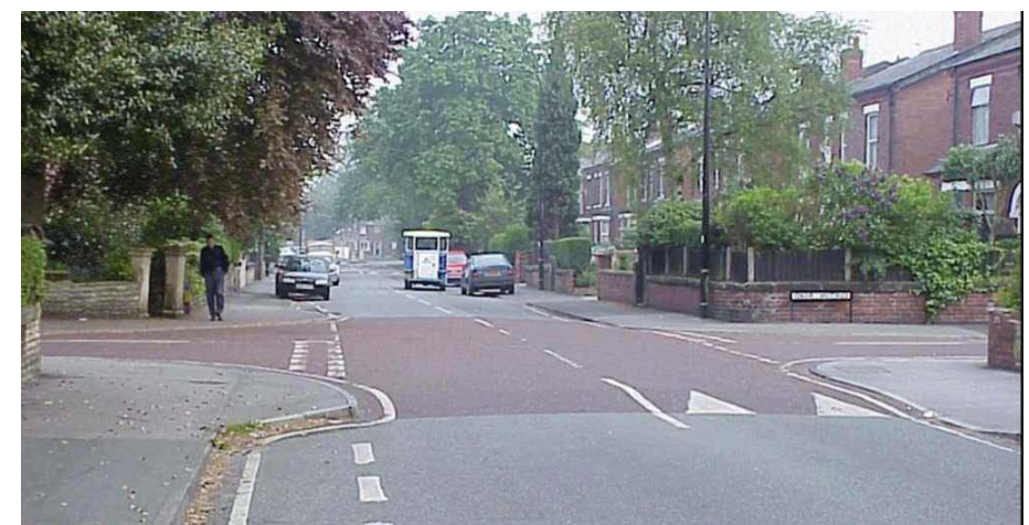
Raised Intersection 11/16 N.T.S.