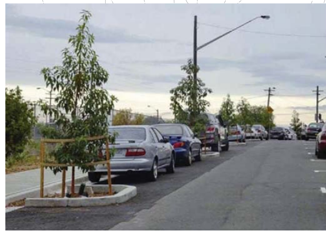
In-street Tree Placement 11/16 N.T.S. Source: Town Streetscape

Progress Print For Review Only February 8, 2017 CP-1 Sheet 1 of 1 Project Number 29694.00