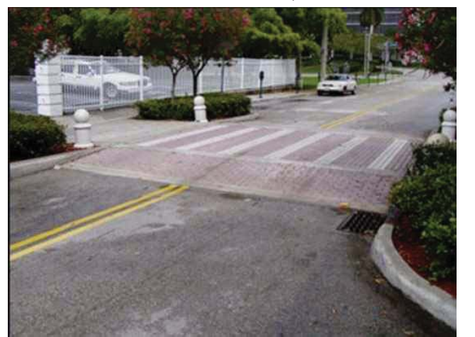
Raised Crosswalk 11/16 N.T.S.