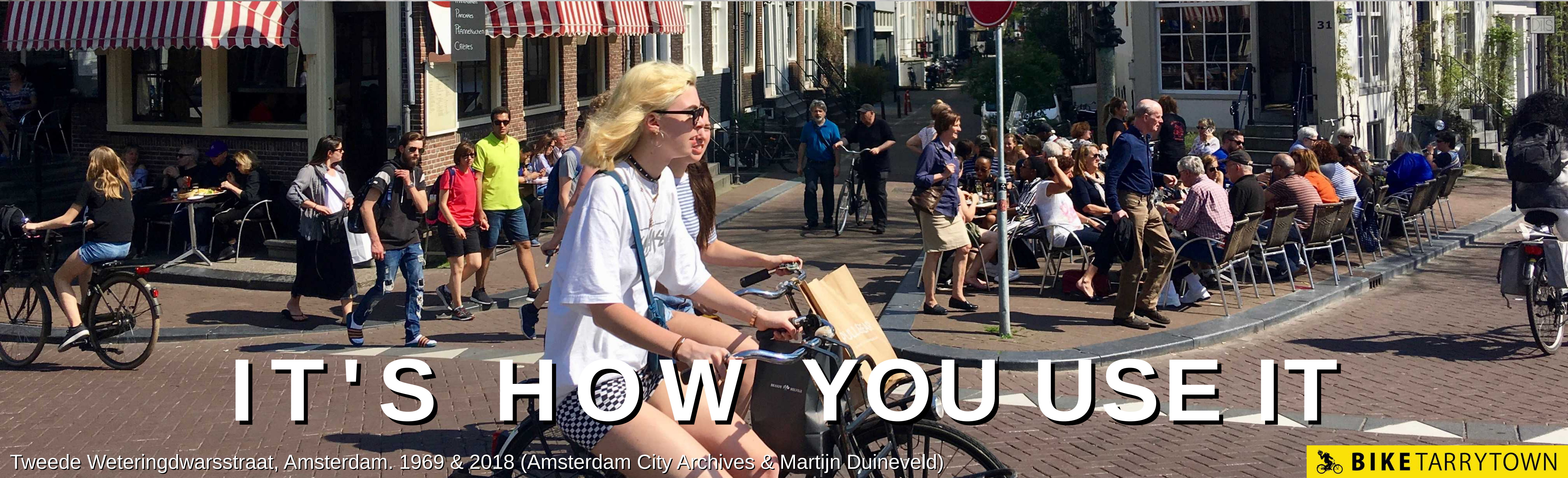
Tweede Weteringdwarsstraat, Amsterdam. 1969 & 2018