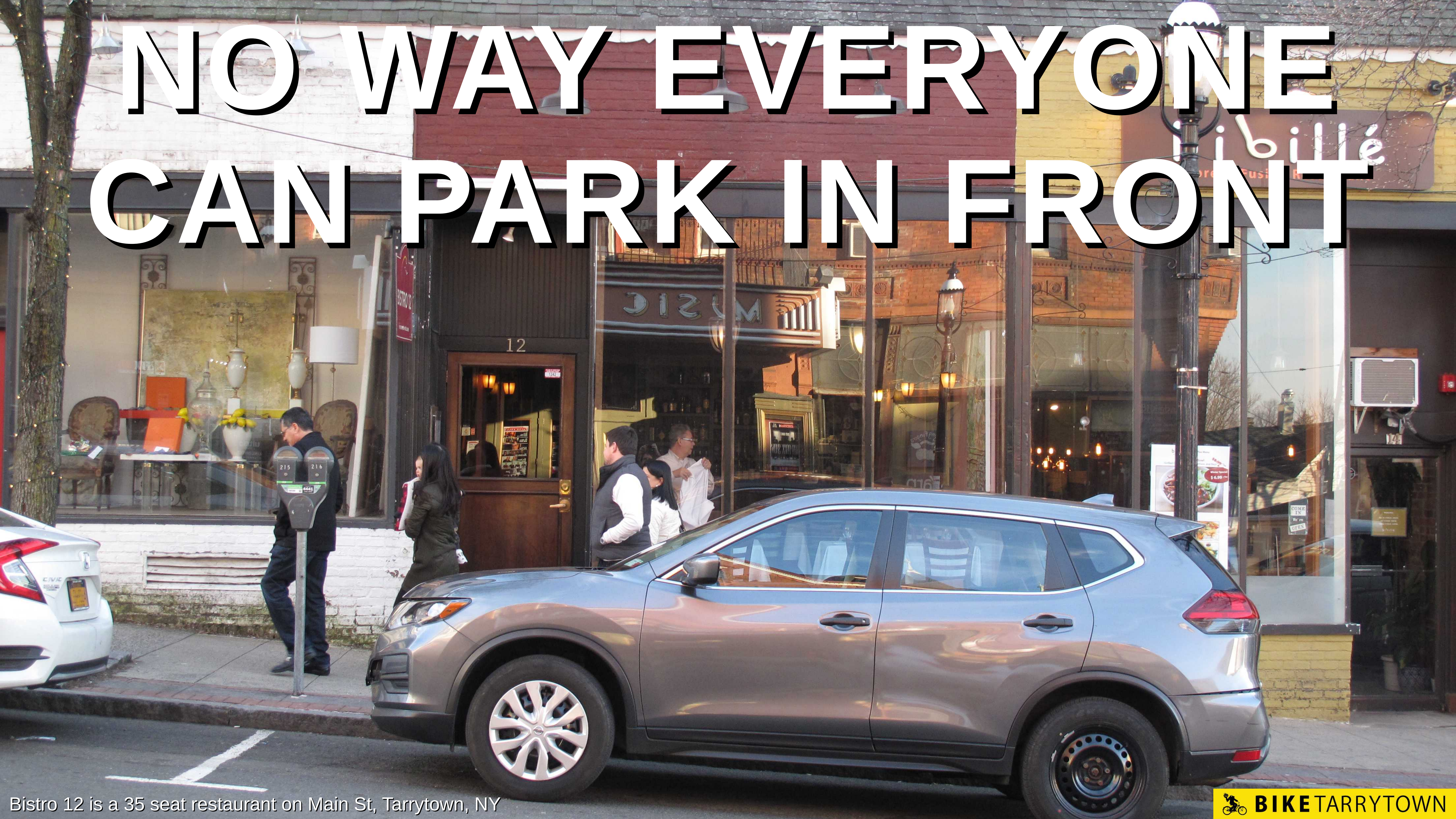
Bistro 12 is a 35 seat restaurant on Main St, Tarrytown, NY