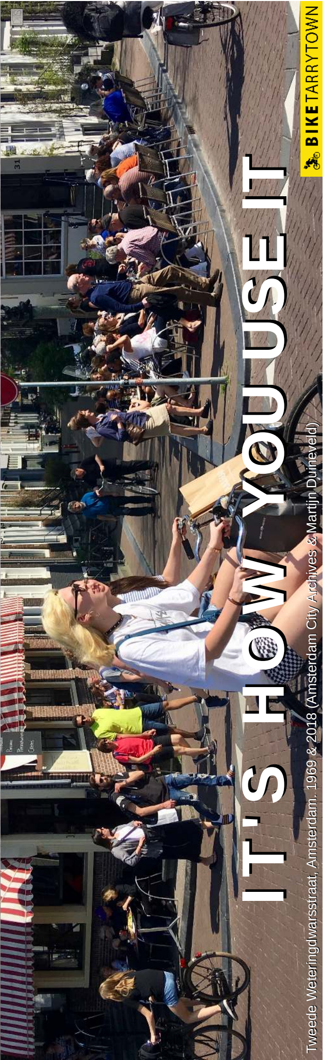
Tweede Weteringdwarsstraat, Amsterdam. 1969 & 2018