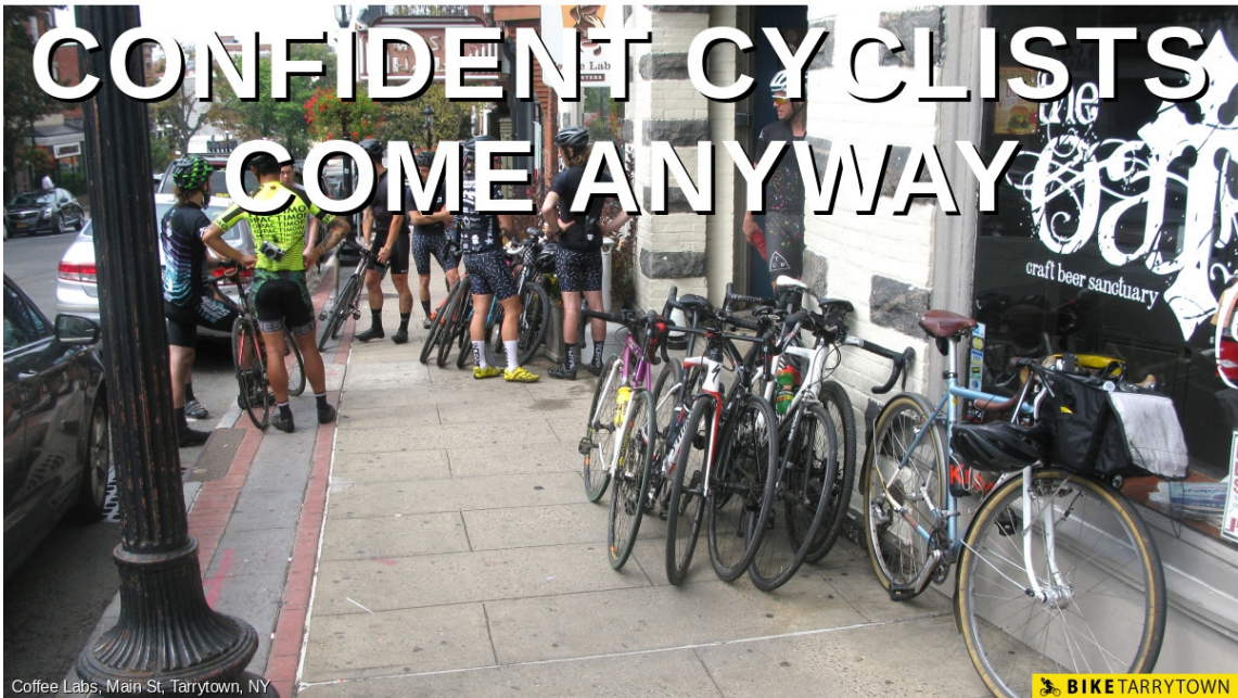
Coffee Labs, Main St., Tarrytown, NY