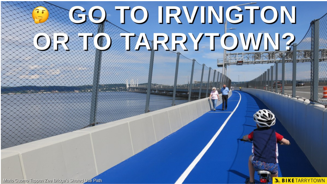
Mario Cuomo Tappan Zee Bridge's Shared Use Path