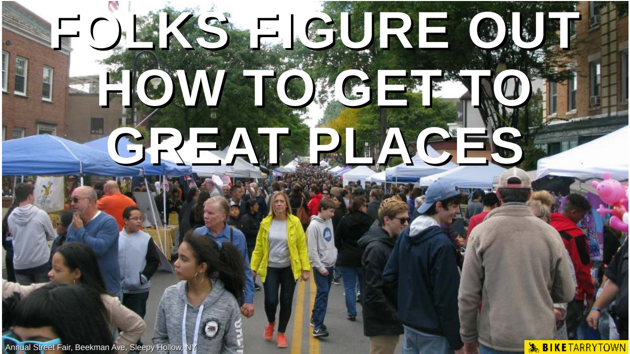
Annual Street Fair, Beekman Ave, Sleepy Hollow, NY