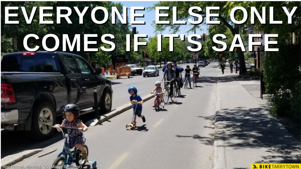
Rue Rachel, Montreal, QC