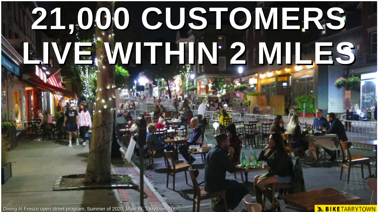
Dining Al Fresco open street program, Summer of 2020, Main St, Tarrytown, NY