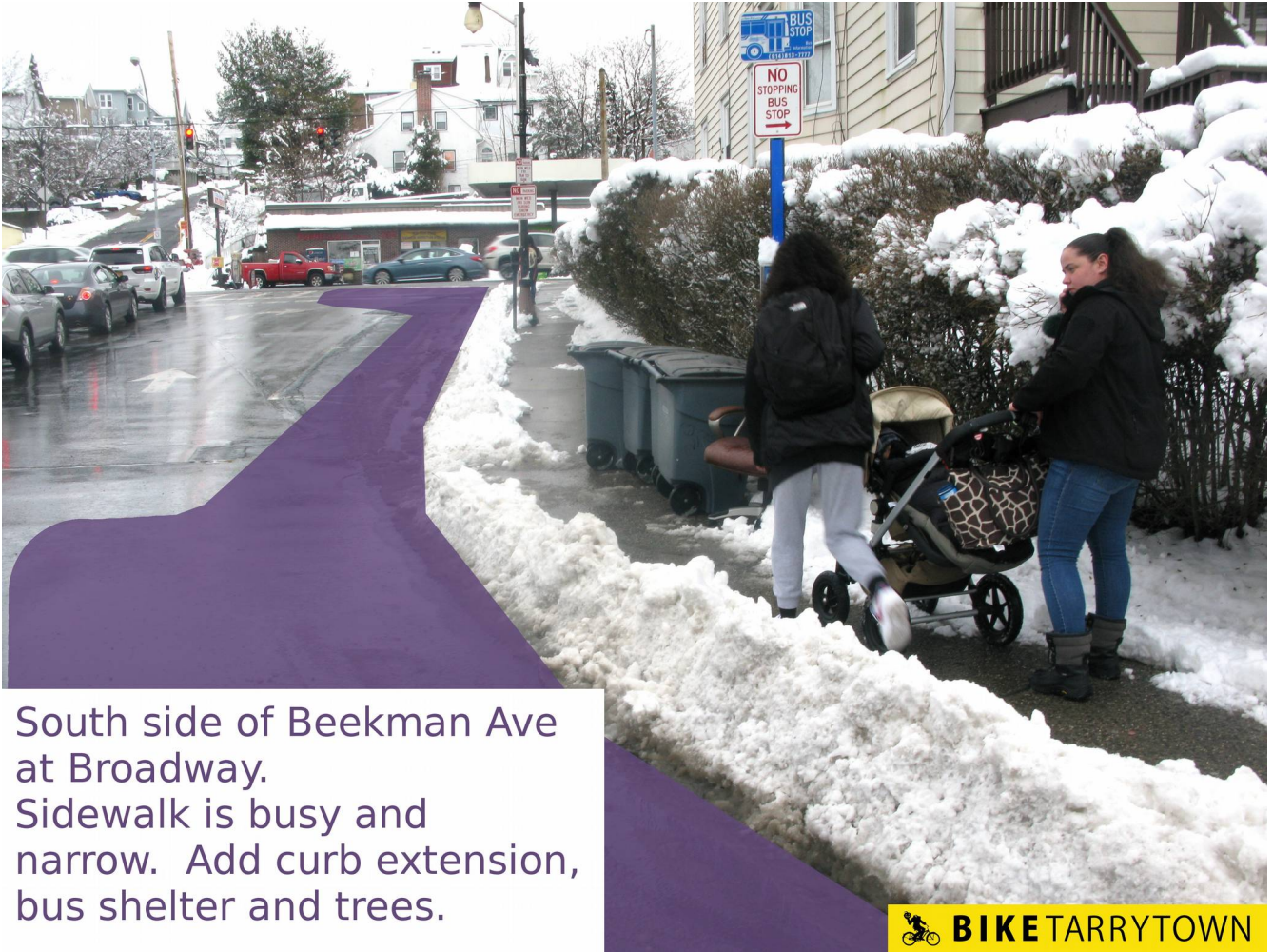
South side of Beekman Ave at Broadway. Sidewalk is busy and narrow. Add curb extension, bus shelter and trees.